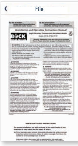
Installation and Operation Manuals