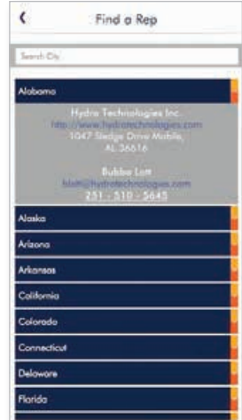
Find a Rep: Locate a BOCK Rep