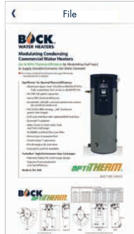
Specification Sheets: Find spec's on all BOCK Products